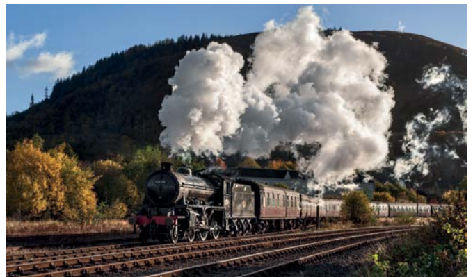
Fort William to Mallaig steam train experience