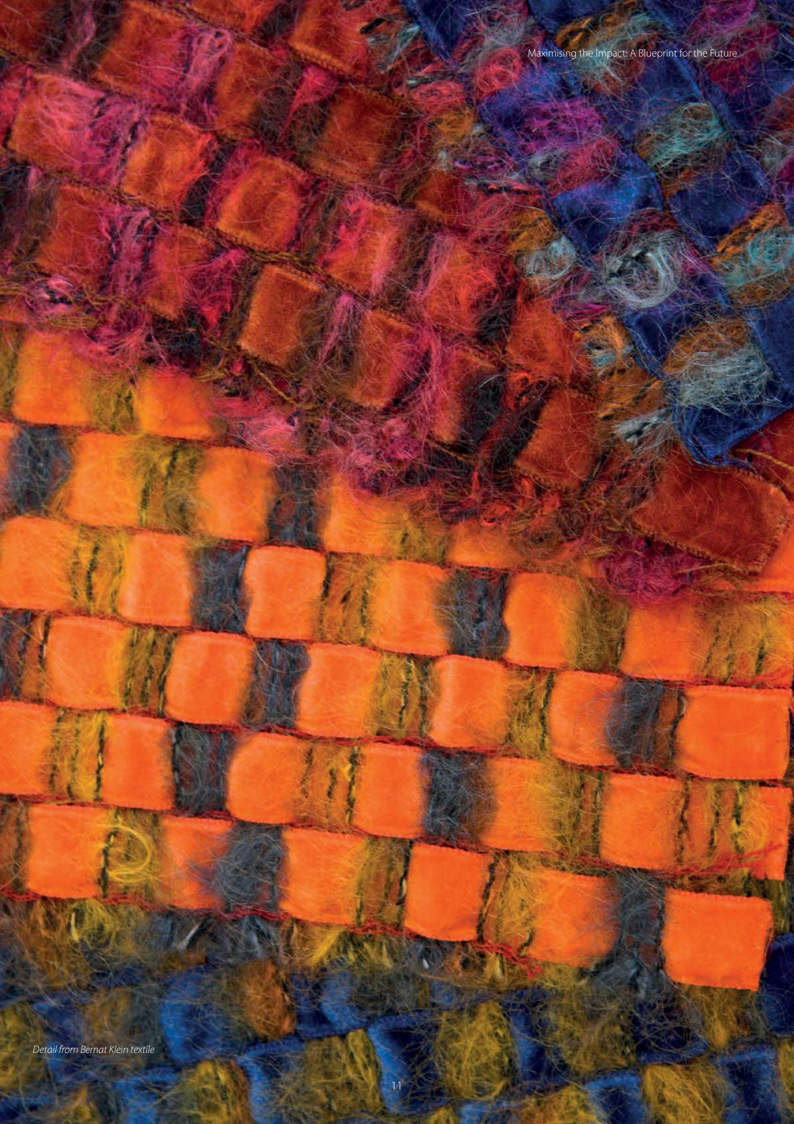
Detail from Bernat Klein textile