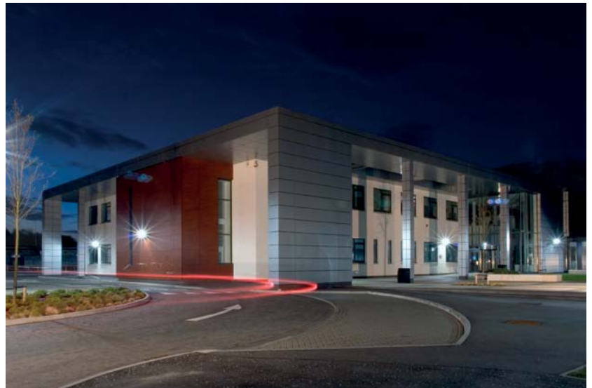
Borders Campus, Galashiels - home to the Scottish School of Textiles & Design