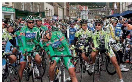
Tour of Britain, Peebles

This will coincide with the beginning of international events such as the 2015 Walking Festival and the Tour of Britain.