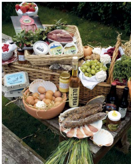
Showcasing local food and drink

Operational services will begin on the new Borders Railway in September 2015. Track will be laid, signalling tested, drivers trained and seven new stations will welcome their first users.