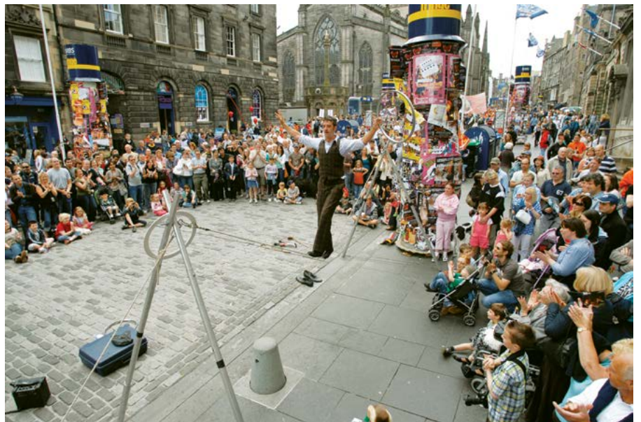
The Edinburgh Festival

The Borders Railway is a fundamental part of delivering our Tourism Scotland 2020 Strategy and promoting growth in Scotland's visitor economy to 2020. By 2016, the Borders Railway will be delivering an annual capacity for 1.9 million return journeys and we want to see a significant proportion of these being used by visitors.