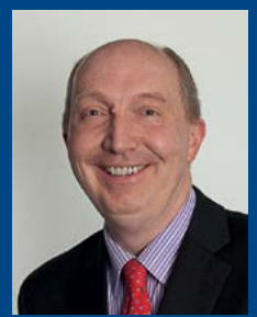
Councillor Andrew Burns Leader The City of Edinburgh Council