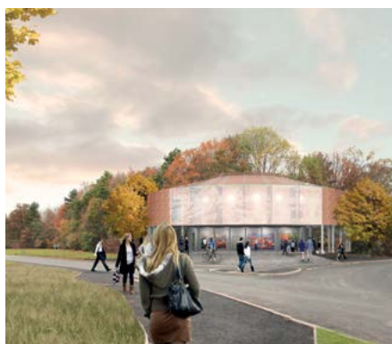
Great Tapestry of Scotland – architect drawing

For the official Opening Celebration weekend, we are planning an exciting programme of activities. The Borders Railway Exposition will showcase what is on offer in the Railway Corridor Area and Station Hubs under various themes including trade and investment, food and drink and textiles manufacture.