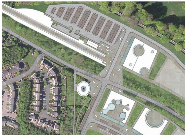
Central Borders Business Park – plan