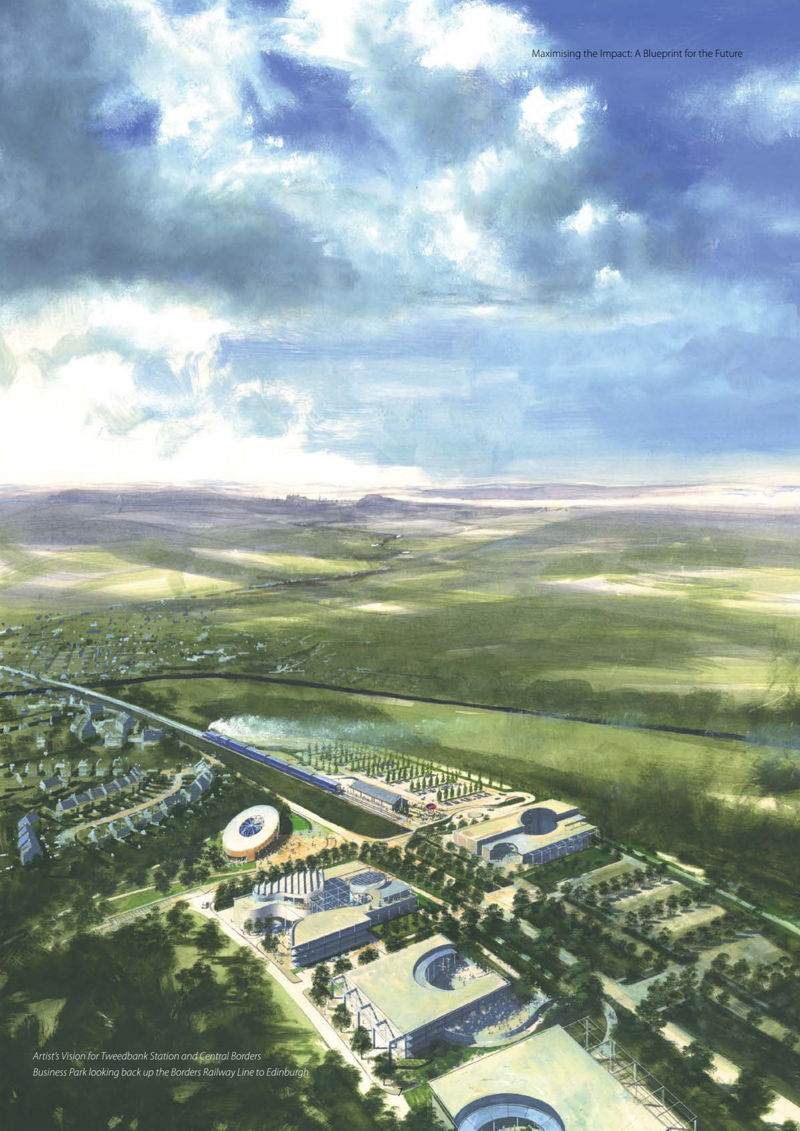
Artist's Vision for Tweedbank Station and Central Borders Business Park looking back up the Borders Railway Line to Edinburgh