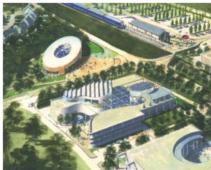
Central Borders Business Park – detail from artist drawing